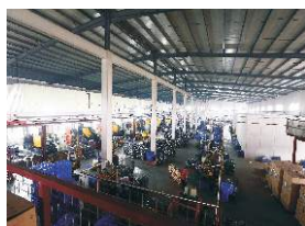
• Die casting workshop