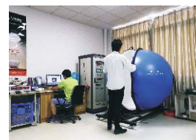
• IES testing