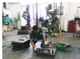
• Die sinking