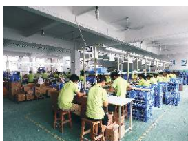
• Production line