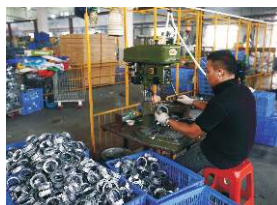
• Stamping 1