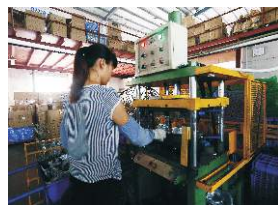
• Stamping 2