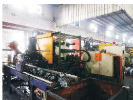
• Robot die casting 1